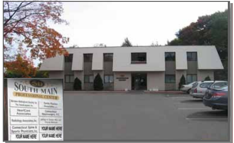
Three Units Available for Lease

H. Pearce Commercial Real Estate is pleased to offer three units in this professional office building in the downtown area of Wallingford across from Town Hall. First floor units are 1,132 sf and 1,500 sf. The second floor unit is 2,632 sf and may be divided and customized to suit your needs. Lower level is fully leased. Plenty of parking with two lots to serve the building.