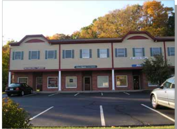
805 SF Office Condo Available for Sale or Lease

H. Pearce Commercial Real Estate is pleased to offer an 805 sf office condo for sale or lease in well maintained 24-unit complex. Plenty of parking. Minutes to I-91 and RT 15 (Wilbur Cross Highway). Banks, post office, restaurants, gas station, and more, all nearby.