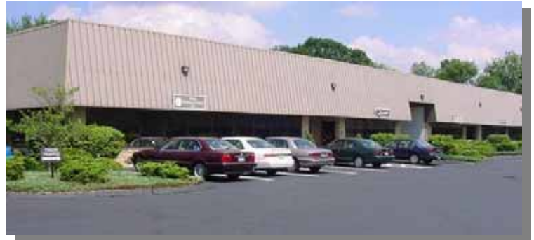
1,543 SF Professional Office Condo Available for Sale

H. Pearce Commercial Real Estate is pleased to offer a 1,543 sf professional office condo in well-kept business park. The condo has five offices, kitchenette and storage area with drive-in OH door.