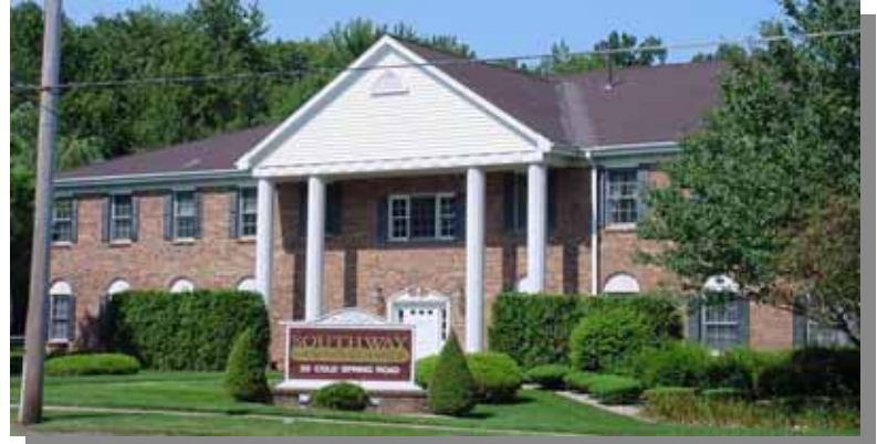
Office Condo Available For Sale or Lease

H. Pearce Commercial Real Estate is pleased to offer a 2,640 sf office condo for sale or lease in well maintained Southway Executive Park. Included are a reception area, 4 private offices, conference room, storage room, large open area and a kitchenette. Location is in close proximity to I-91, hotels, shopping, restaurants and banking.