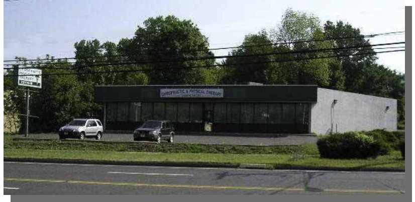
4,900 SF Available for Sale or Lease

H. Pearce Commercial Real Estate is pleased to offer a 4,900 sf building (expandable) in high traffic/high visibility area along the Silas Deane Highway. Excellent location for retail, medical and/or service related business. Just 1/2 mile to I-91.