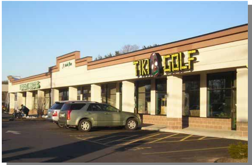
6,880 Square Feet (Divisible) - Retail / Office

H. Pearce Commercial Real Estate is pleased to offer up to 6,880 sf of excellent space in rapidly developing retail/commercial area on Washington Avenue. Location has immediate proximity to Anthem Blue Cross (the future home of Quinnipiac University Grad School). Space is also well suited for general office or medical office. On site, paved, free parking for 90 cars.