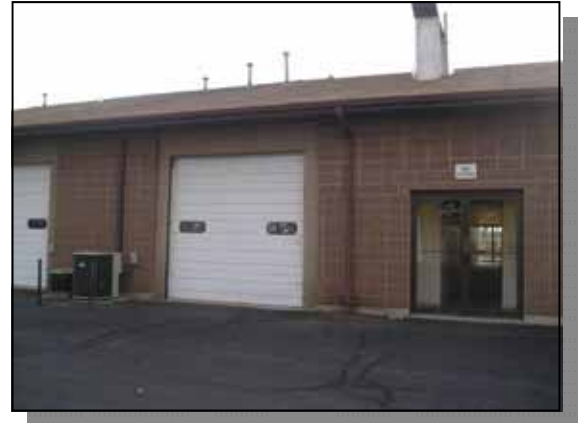
850 SF Unit Available for Lease

H. Pearce Commercial Real Estate is pleased to offer 850 sf of warehouse/light manufacturing space. Includes an overhead door and 14' clear span. Ample parking. This busy location is convenient to I-91 Exits 9 and 10, and to the Merritt Parkway.