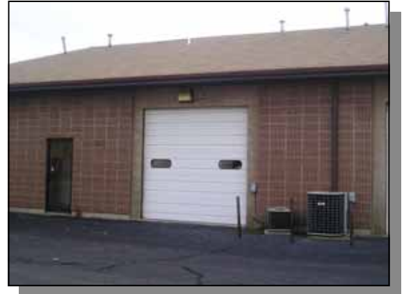
850 SF Unit Available for Lease

H. Pearce Commercial Real Estate is pleased to offer 850 sf of warehouse/light manufacturing space. Includes an overhead door and 14' clear span. Ample parking. This busy location is convenient to I-91 Exits 9 and 10, and to the Merritt Parkway.