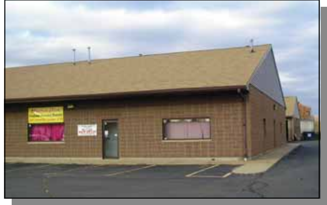
1,200 SF Unit Available for Lease

H. Pearce Commercial Real Estate is pleased to offer 1,200 sf of office/showroom. Includes three private offices and an open bullpen. Flexible use. Ample parking. An additional 850 sf of rear warehouse space could also be available. This busy location is convenient to I-91 Exits 9 and 10, and to the Merritt Parkway.