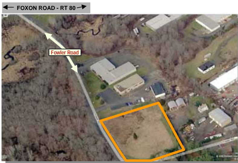
2.0 Acres Available for Sale

H. Pearce Commercial Real Estate is pleased to offer 2.0 acres of clear, vacant, industrial land for sale. Maximum footprint on first floor is 9,000 sf. Zoned for many uses. Survey available.