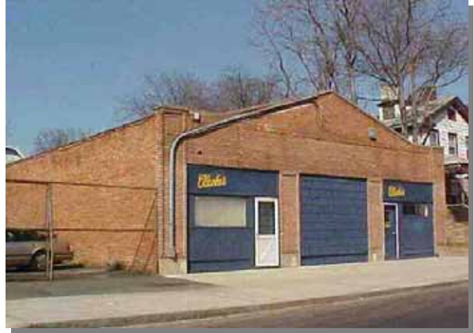
6,772 Square Feet Available for Lease

H. Pearce Commercial Real Estate is pleased to offer a 6,772 sf office/warehouse facility available for lease. An affordable opportunity, as is, for small contractors in need of office space and warehouse storage. Owner is willing to renovate the building to suit office tenants. Space may be subdivided.