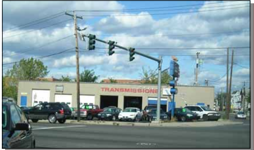
4,100 SF Retail Building for Sale or Lease

is pleased to offer this 4,100 sq. ft., six bay, vehicle repair facility for sale or lease. Six drive in over head doors. Located in high traffic area with great visibility on 0.3 acre corner site.