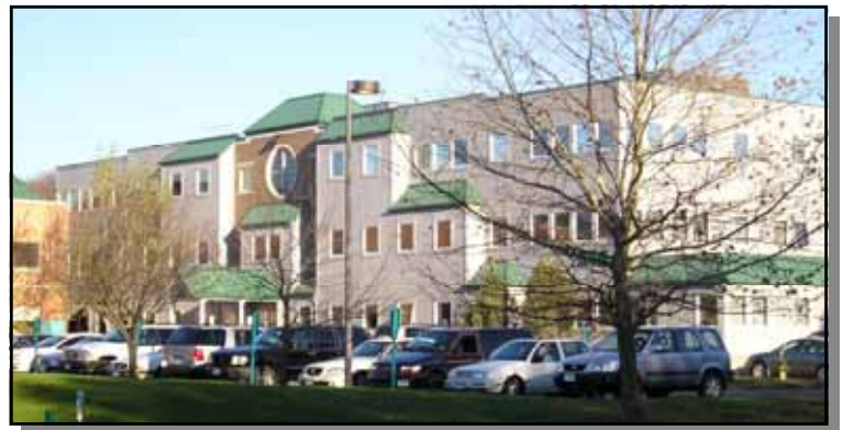
1,988 SF Medical / Office Space

H. Pearce Commercial Real Estate is pleased to offer 1,988 SF of space available for long-term sublease in the Middletown Professional Park, a successful three building office/medical complex. Excellent location on Saybrook Road in Middletown with easy access to Route 9 (exits 11 and 12) next to Middletown Hospital's surgical center, outpatient center, and laboratory.