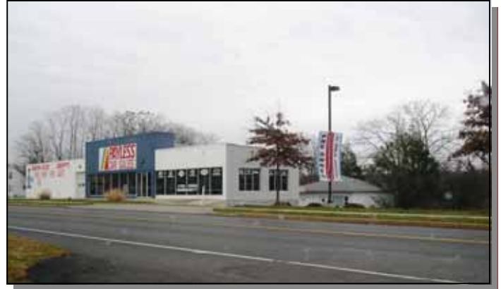
4,380 Square Feet Available for Sale or Lease

H. Pearce Commercial Real Estate is pleased to offer a 4,380 SF auto facility situated on 2.28 acres. The location offers great visibility near the Meriden/Wallingford town line.