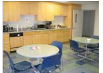
● 14 New Road—Madison, CT