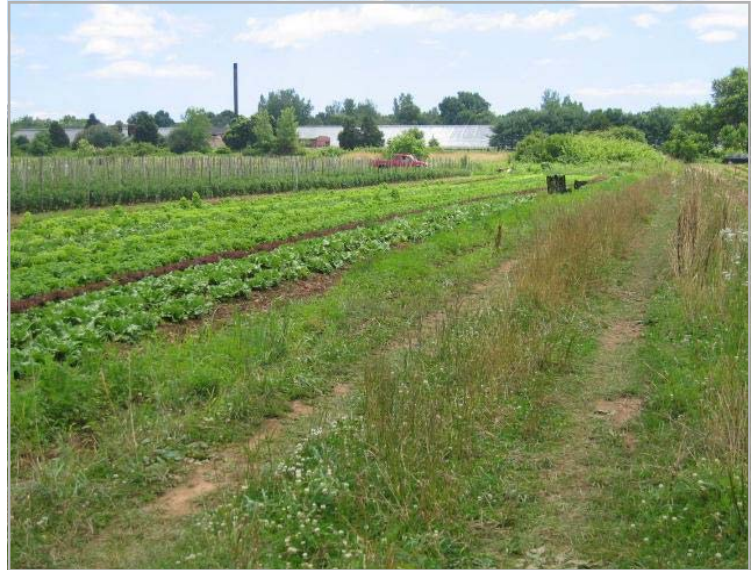
7.72 Acres - Ready for Development

is pleased to offer 7.72 acres of farmland near town. Possible for active senior 55+, assisted living or office / light industrial. Close to all amenities, highways and shopping.