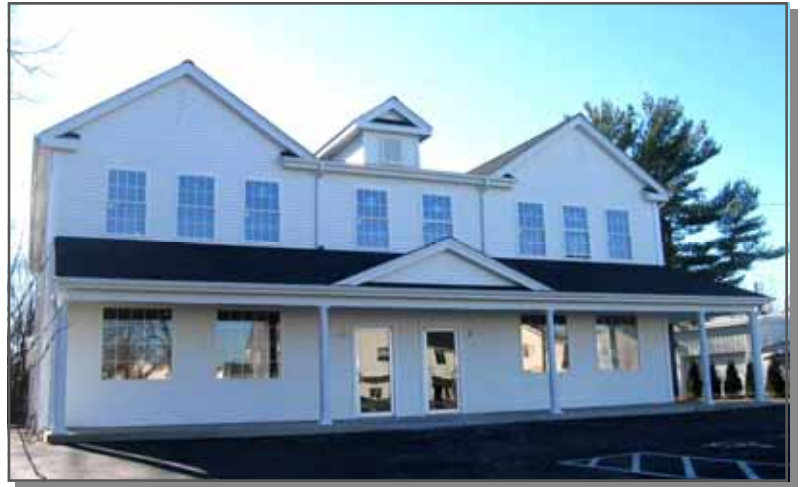
1,040 SF Unit Available for Lease

H. Pearce Commercial Real Estate is pleased to offer 1,040 square feet of professional office space for lease in a newly constructed building conveniently located on Route 1 in Guilford. Easy access to I-95, Guilford center and Branford.