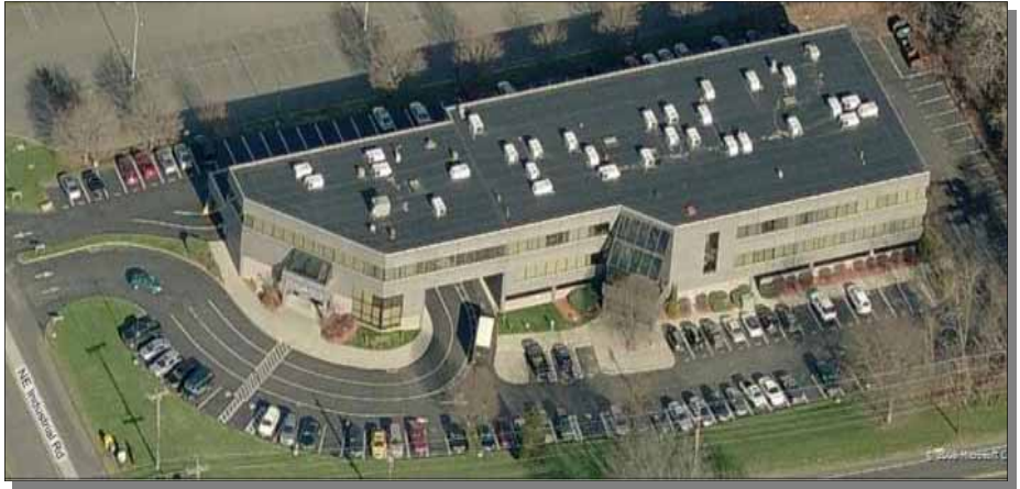
Office and/or Medical space - 1,100 SF Available

H. Pearce Commercial Real Estate is pleased to offer 1,100 SF of office/medical space for lease in the "People's Bank Building." This premier Class 'A' office complex is located in the heart of Branford's business district and is ideally situated on U.S. Route 1 (East Main Street) between Exits 55 and 56 of I-95, minutes from downtown New Haven.