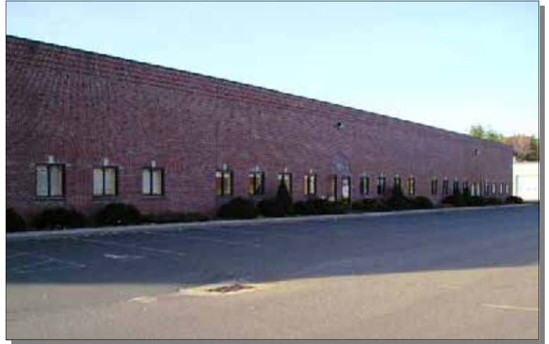
Available for Lease - 8,333 SF

H. Pearce Commercial Real Estate is pleased to offer an 8,333 SF sublet of industrial/warehouse space in a 50,000 sf building. Space includes 800± sf office with AC, 18' ceiling height, and 1 loading dock. Ready for immediate occupancy. Additional space may be available.